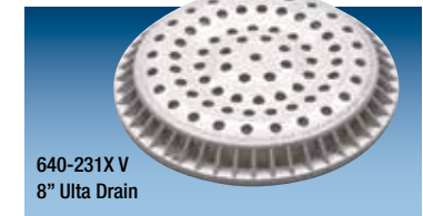
640-231X V 8" Ultra Drain