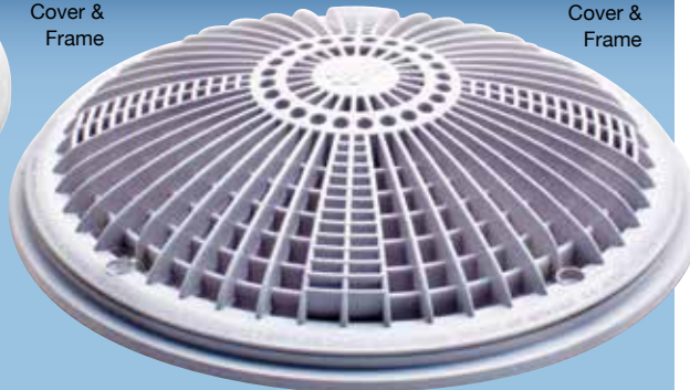
10" Tru Flo Drain