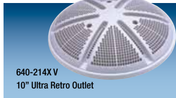
640-214X V 10" Ultra Retro Outlet