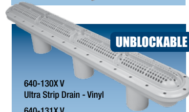
640-130X V Ultra Strip Drain - Vinyl 640-131X V Ultra Strip Drain - Fiberglass 640-132X V Ultra Strip Drain - Concrete 640-133X V Ultra Strip Drain - Field Built