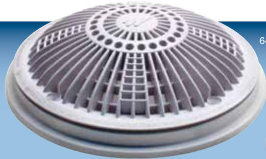
8" Tru Flo Drain

Listed, Certified and Tested in strict accordance to the requirements of ASME A112.19.8-2007 and ASME A112.19.8a-2008 (as defined in CPSC letter dated April 8, 2011). Compliant to the latest Consumer Safety Product Commission Requirements (CPSC).