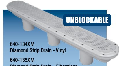
640-134X V Diamond Strip Drain - Vinyl 640-135X V Diamond Strip Drain - Fiberglass 640-136X V Diamond Strip Drain - Concrete 640-137X V Diamond Strip Drain - Field Built