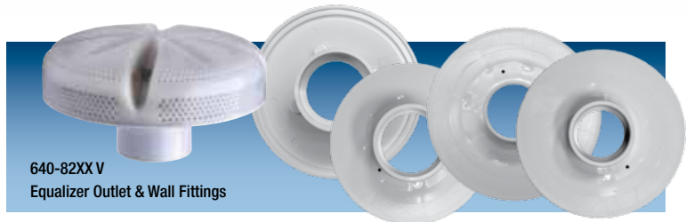
640-82XX V Equalizer Outlet & Wall Fittings