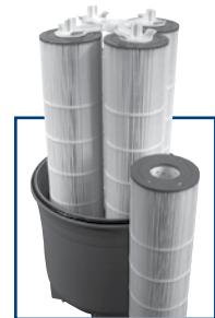
Four-cartridge design simplifies element removal and extends time between cleaning cycles