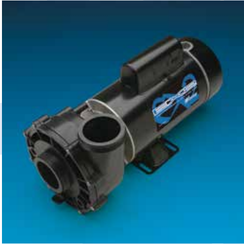
EX2 Performance Chart