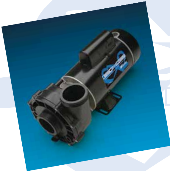
EX2 Performance Chart