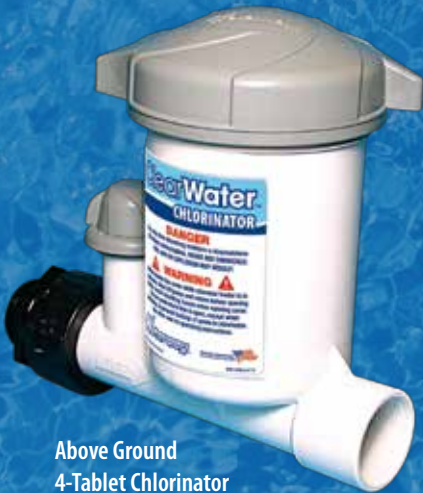
Above Ground 4-Tablet Chlorinator