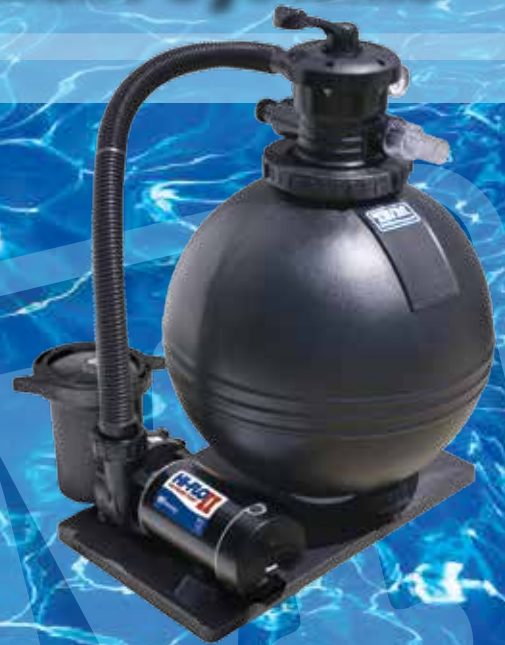
22" Filter with 1.5 HP Pump