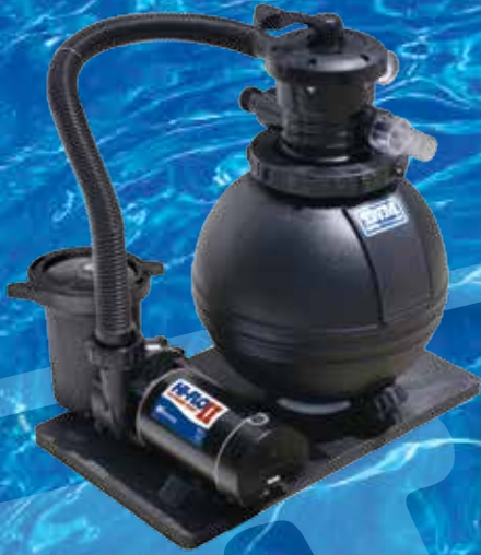
16" Filter with 1 HP Pump