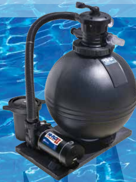
19" Filter with 1 HP Pump