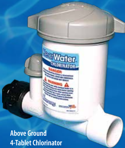
Above Ground 4-Tablet Chlorinator