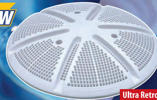
Ultra Retro Drain

Part Number: 640-212x V • 640-213x V • 640-214x V Description: Ultra-Retro Drain Size: 10" Open Area: 20.4 sq. in. Floor Flow Rate: 224 GPM @ 3.53 ft/sec Wall Flow Rate: 192 GPM @ 3.03 ft/sec GPM @ 1.5 FPS: 95 GPM Frame Size: 10" Round