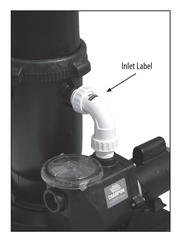
3. Finished installation should look like the picture in Figure 3. The Inlet label is on top and before the union going into the filter.