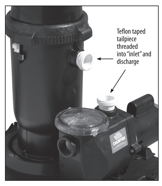
1. Install threaded union adapters on inlet to filter and discharge (top) of pump, using Teflon tape supplied. Use four wraps of the Teflon tape on adapter for proper seal.